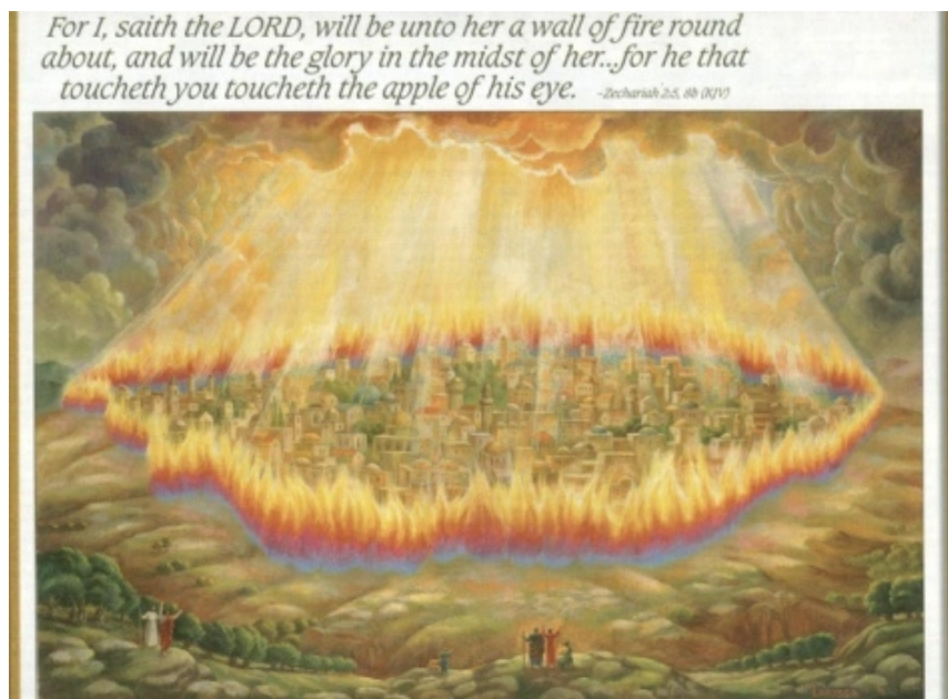
The Coming Associated With Holyday 3